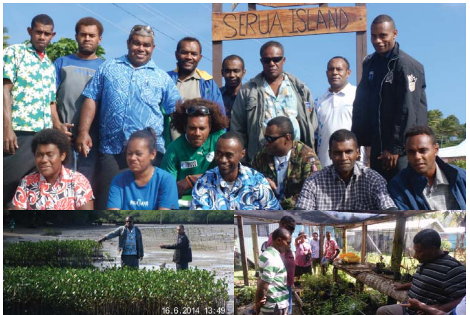
Representatives from the villages in the Ra Province.

Day two saw the Ra team head to Yanuca island. A rocky terrain