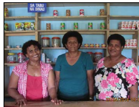
Women of Nayawa Village

Through their diligence and persistence the women of the village through the help of a project funded by Australian Foundation for the People of Asia and the Pacific (AFAP) and implemented in Fiji by Partners in Community Development Fiji (PCDF) Organization have been able to reopen their own co-operative shop after a lapse of two years and have their saving